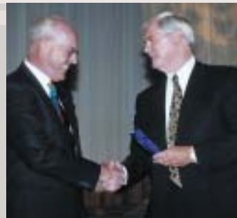
Howard with Nevada Governor Kenny Guinn, at the Governor's Annual Economic Development Conference

Change: Transforming Organizations Successfully. In turbulence, focus, resize, simplify, clarify and don't procrastinate. Organize for flexibility (flow state) and utilize the different stages of turbulence to expedite change and transformation.